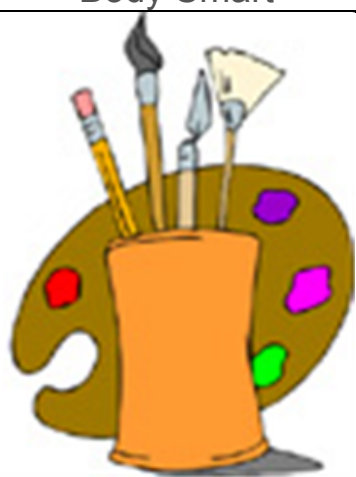
Spatial Intelligence or Picture Smart

In the workplace, people who require bodily-kinesthetic intelligence include: models, gymnasts, athletes, inventors, and mechanics.